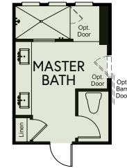
OPT. WALK-IN SHOWER AT MASTER BATH