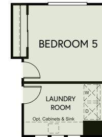
OPT. BEDROOM 5 IN LIEU OF LOFT