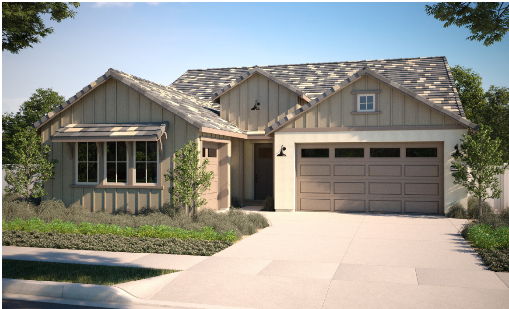
ELEVATION A (MODELED)

4 Beds | 3 – 4 Baths | Optional Home + | 2-Bay Garage