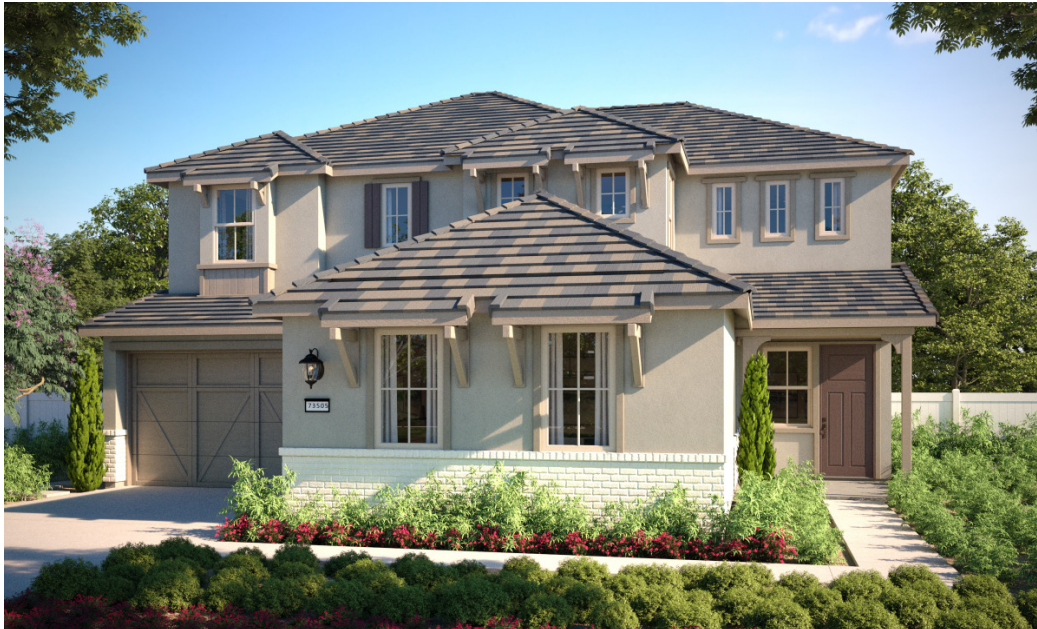
ELEVATION B (MODELED)

4 – 5 beds | 3.5 Baths | Optional Home + | 3-Bay Garage