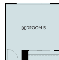
OPTIONAL BEDROOM 5