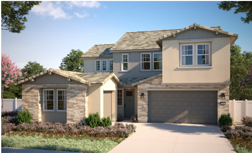
ELEVATION C (MODELED)

4 – 5 beds | 3.5 – 4.5 Baths | Optional Home + | 3-Bay Garage