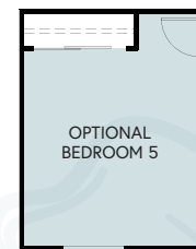
OPTIONAL BEDROOM 5