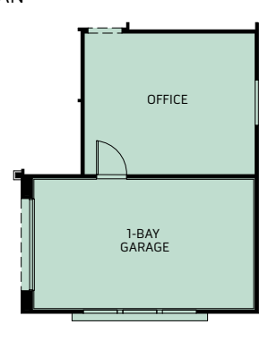
OPTIONAL 1-BAY GARAGE & OFFICE