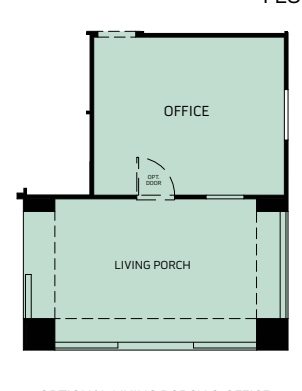
OPTIONAL LIVING PORCH & OFFICE